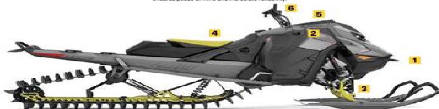
COMMIT X 185 850 E-TEC TURBO R SNOWS

Highest-quality KYB high pressure gas front shocks with an updated lighter weight design. Rebuildable and rethreadable.