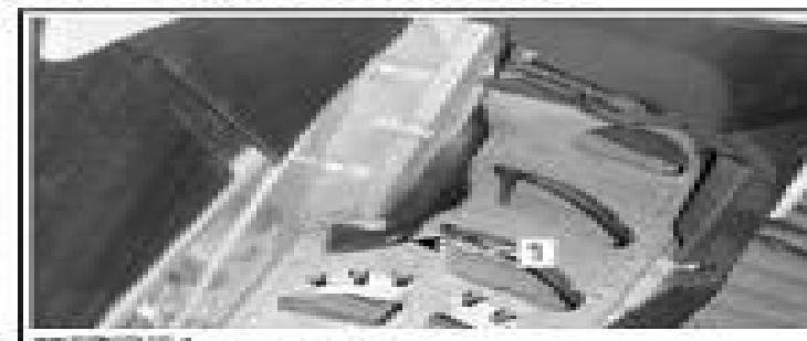
1. Reinforced holes in footrest

To lift the snowmobile securely, it is important to use the reinforced footrest holes.