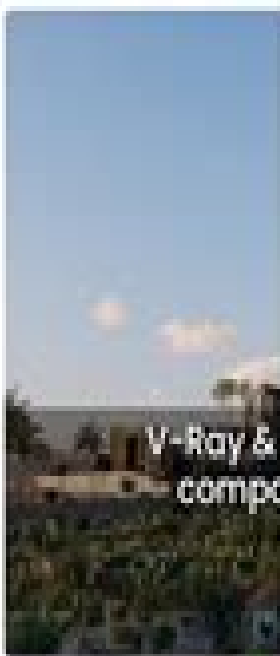
V-Ray & Enscape compatibility