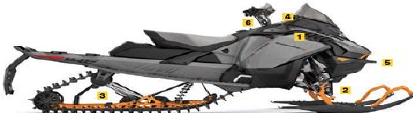
BACKCOUNTRY X 145 850 E-TEC SNOWMOBILE

Completely new lighter design is better balanced for performance on- and off-trail. Perfectly balanced weight transfer for an increased fun factor and more travel for more comfort and bump absorption.