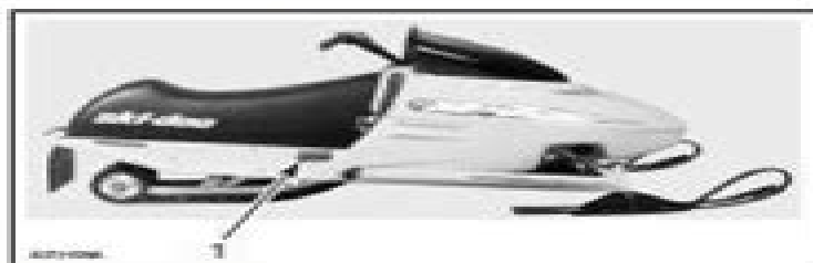
1. Vehicle serial number