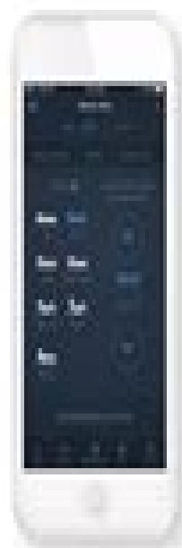
Adjust and save your favorite bed position.