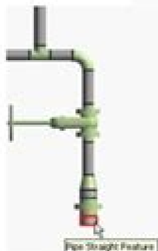
Features in a Pipe Run