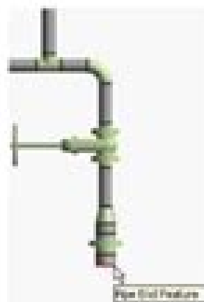
Features in a Pipe Run

Straight Feature Turn Feature Along Leg Feature End Feature Run Change Feature Branch Feature Run Change Feature