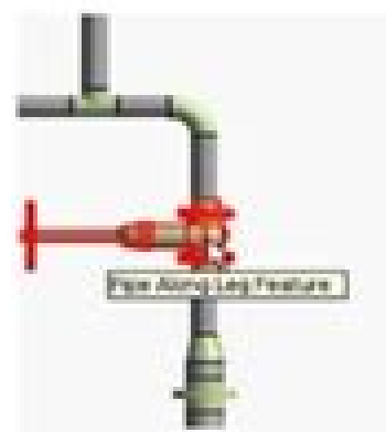
Features in a Pipe Run