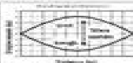
— Group 1: Non-Indigenous (non-Indigenous people who have been living in the area for a long time)

These characteristics make the system suitable for a library, where it can be used to store and retrieve information. The system is also suitable for a small business, where it can be used to store and retrieve information.