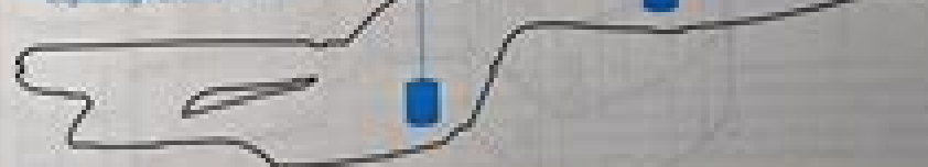
4.1.1 Location of main computer cores