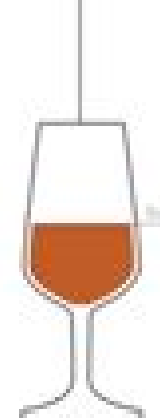
Dessert Wine Glass