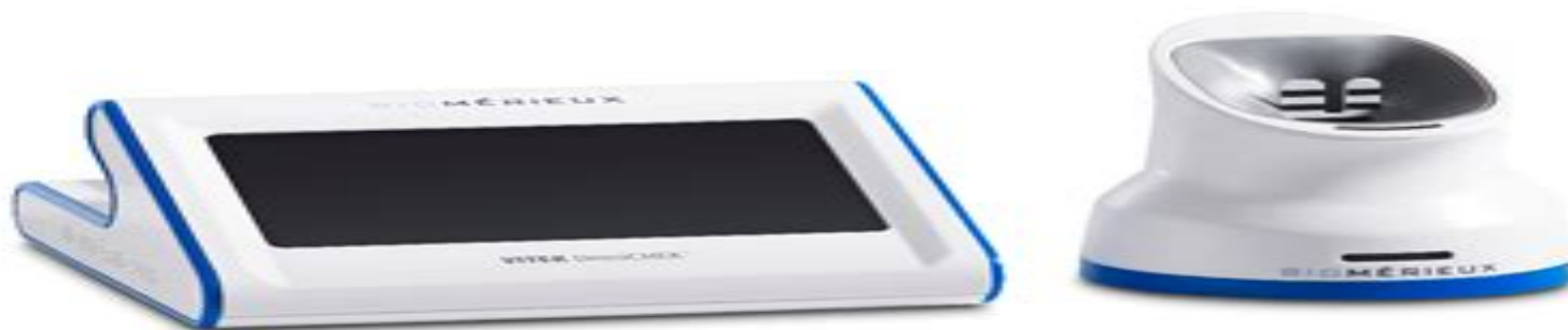
Figure 14: Display Base and Pod Overview