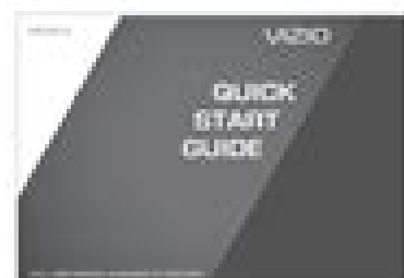
Quick Start Guide