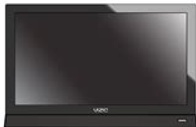
VIZIO LCD HDTV

Before installing your new TV, take a moment to inspect the package contents. Use the images below to ensure nothing is missing or damaged.