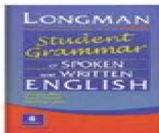
LONGMAN STUDENT GRAMMAR OF SPOKEN

The first one is Longman Student Grammar of Spoken and Written English and the other one is Fundamentals of English Grammar .