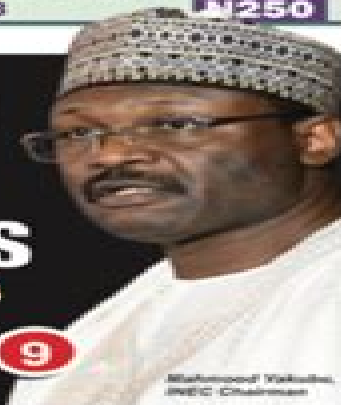
Mahmood Yakubu, INEC Chairman