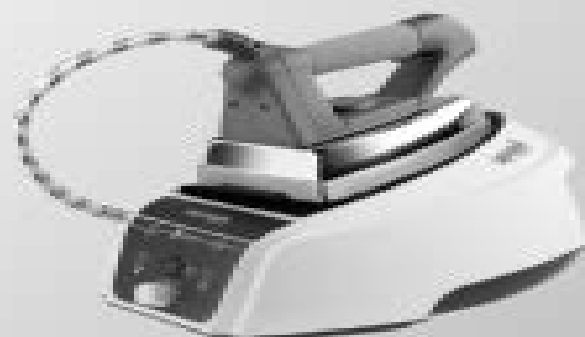
FOREVER 625 PRO