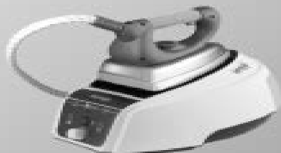
FOREVER 635 PRO