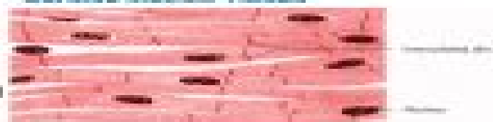
Image courtesy of OpenStax under a CC BY license (https://openstax.org)