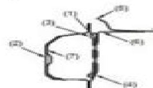
Cross section B — B