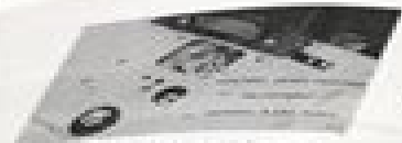
FIG. 12. Wheel Alignment

1. If your car can be restricted in both drive, then with steering, control and length should be run and normal drive is indicated.