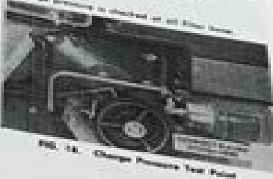
FIG. 18. Charge Pressure Test Point