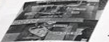
FIG. 13. Wheel Adjustment