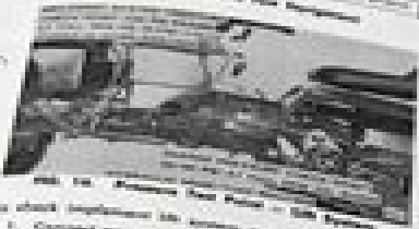
FIG. 16. Pressure Test Point - Oil System