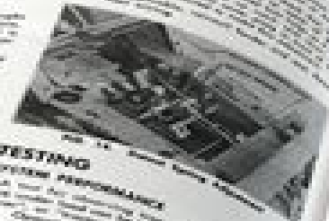
FIG. 14. Wheel Spring Inspection