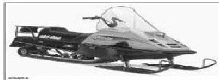
TYPICAL — TUNDRA R

Skandic LT Skandic WT Skandic SWT Skandic WT LC