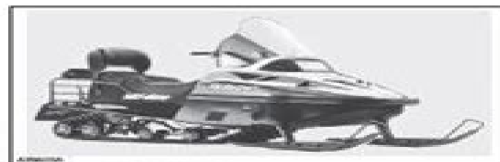
TYPICAL — SKANDIC SERIES