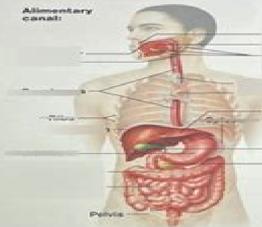
(a) Digestive system anatomy