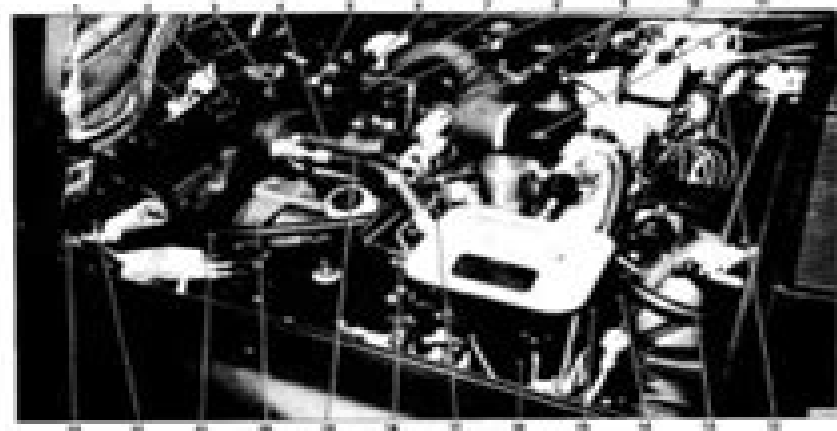
Fig. 103 General view of engine compartment. Note the