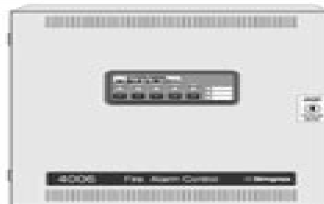
4006-9102 (Beige) Standard Control Panel