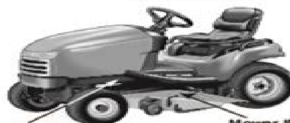
Tractor ID Tag