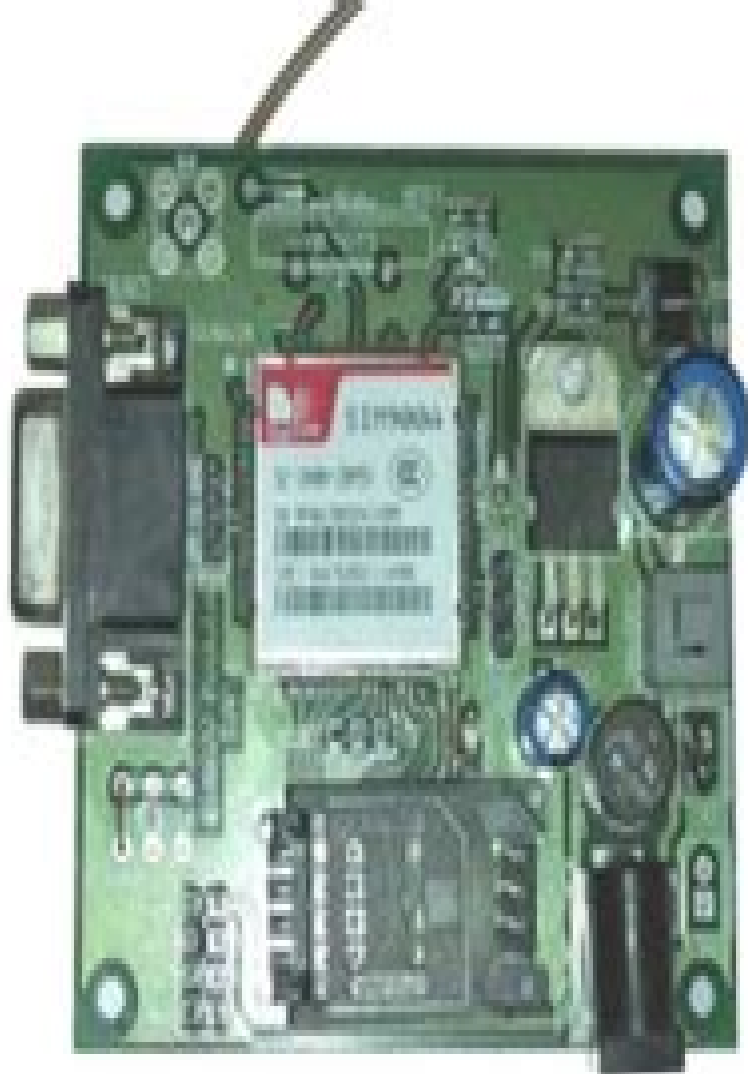
SIM900A GSM Module