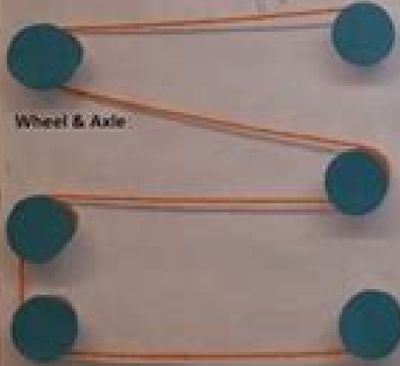
Wheel & Axle