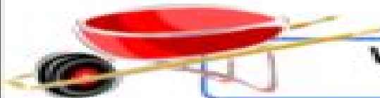
Wheel and Axle