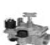
40mm (1 1/2")