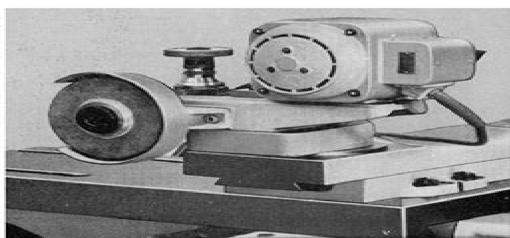
Slide-mounted grinding attachment