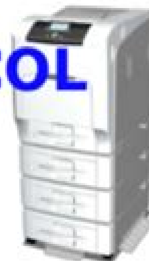
M065/M066 SERVICE MANUAL