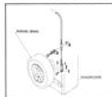
Fig. 15. Adjust Parking Brake Arm