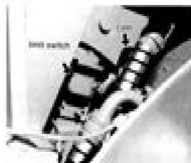
Fig. 12. Brake Room

To obtain maximum length without vertical bracket should be installed in bottom view of frame bracket. The load operation cycle time can be reduced according to the maximum lift to which the frame is set.