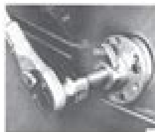
Fig. 69. Removing the pulley hub