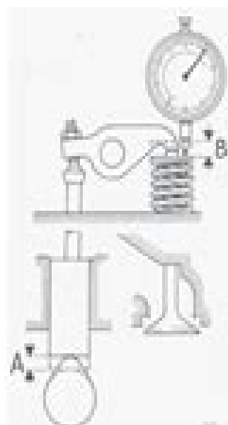
Fig. 68. Checking the lift height