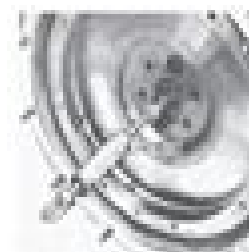
Fig. 72. Removing the flywheel bearing