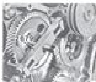
Fig. 70. Removing the camshaft gear