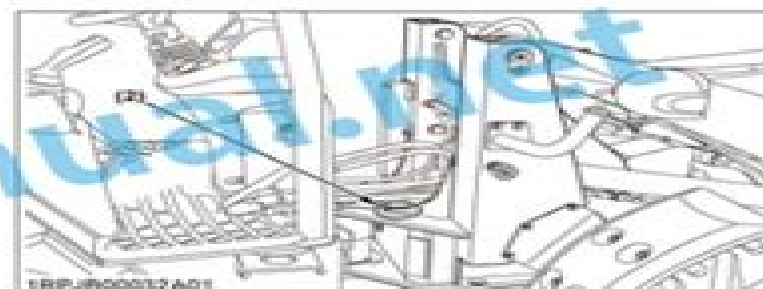
(2) Product identification number