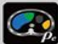
Effective Density Images