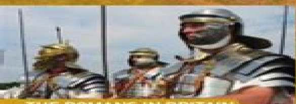
THE ROMANS IN BRITAIN