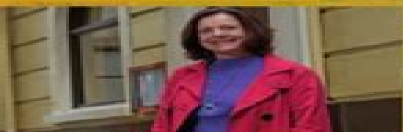
A DICKENSIAN TOUR OF LONDON