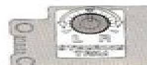
Steering trim Lenkungssteimer Trim de direction Trim dello sterzo