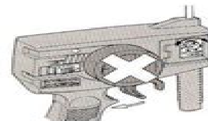
Do not move steering wheel. Das Lenkrad nicht bewegen. Ne pas agir sur le volant de direction. Non muovere il volante.