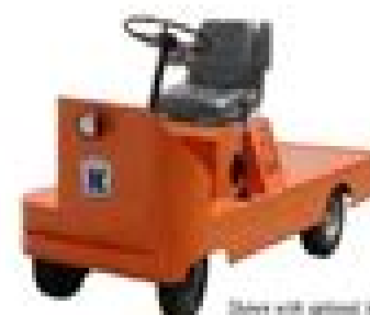
Shown with optional roof guard