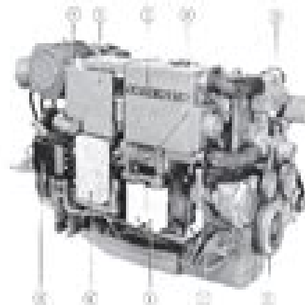
Fig. 3 Engine engine, TAMD60

The engines are fitted with a heat exchanger for thermodynamic, controlled fresh water cooling of the engine block, cylinder heads and exhaust manifold. The exhaust manifold cooling panel is designed so that it also cools the exhaust ports.